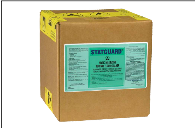
Figure 1. Statguard® Dissipative Neutral Floor Cleaner