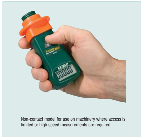
Non-contact model for use on machinery where access is limited or high speed measurements are required