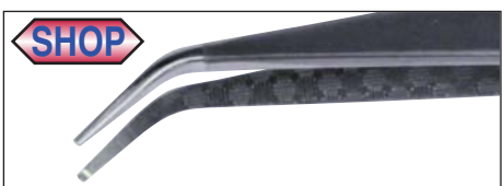
MicroTip 30° Bend & 0.5mm Slot Milled