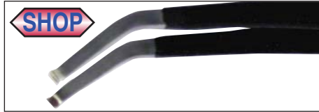
Flat Bent 35°, 2mm Diameter Grip Radius