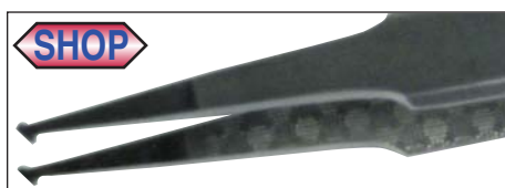
MicroTip 40° Hook 1.6x1x1mm Wide