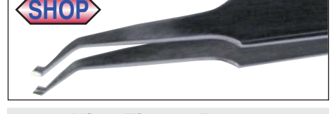
MicroTip 30° Bent & Angled With 0.5 Slot