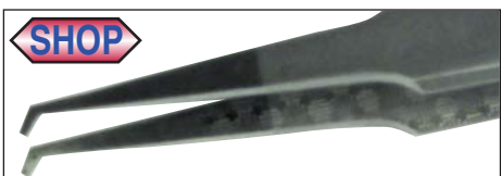
MicroTip 40° Hook 1x1x2mm Long