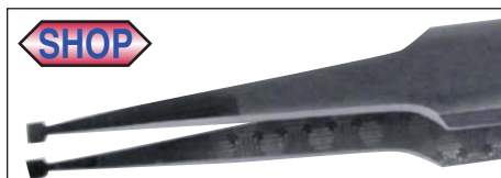
MicroTip Straight & 0.5mm Slot Milled