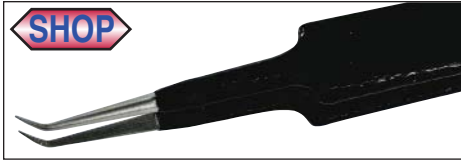
Extra Fine Points Bent 30°, 3mm Long Tips