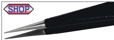
ESD Safe General Purpose Fine Point