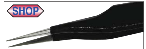
Angled & Slightly Bent With Extra Fine Tips