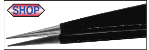
Heavy Duty Strong Tweezers Tapered To Strong Point