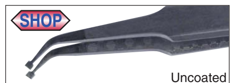
MicroTip Bent 30° - 1.6mm