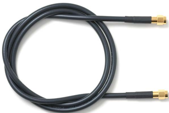
Model 4846-C SMA Plug to SMA Plug, RG58C/U

Small size, and durability for confident connections