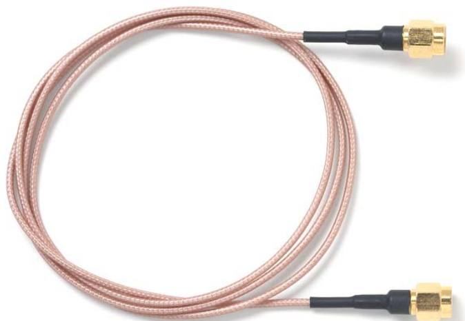
Model 4846-UU SMA Plug to SMA Plug, RG178B/U

Small size, and durability for confident connections