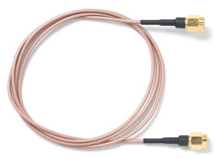
Model 4846-UU SMA Plug to SMA Plug, RG178B/U