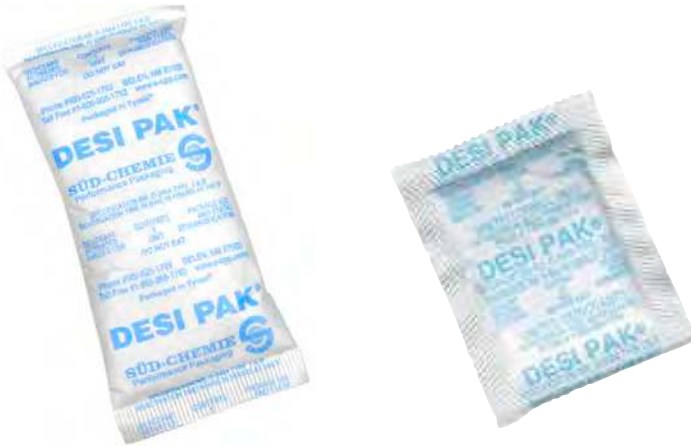
48887 & 48888

In order to provide a complete moisture barrier packaging assembly, desiccant must be inserted into the bag, prior to having the bag vacuum sealed. The recommended amount of desiccant is dependent on the interior surface area of the bag to be used. Figure 4 is a reference table indicating recommended minimum amounts of desiccant that should be used with Moisture Barrier Bags.