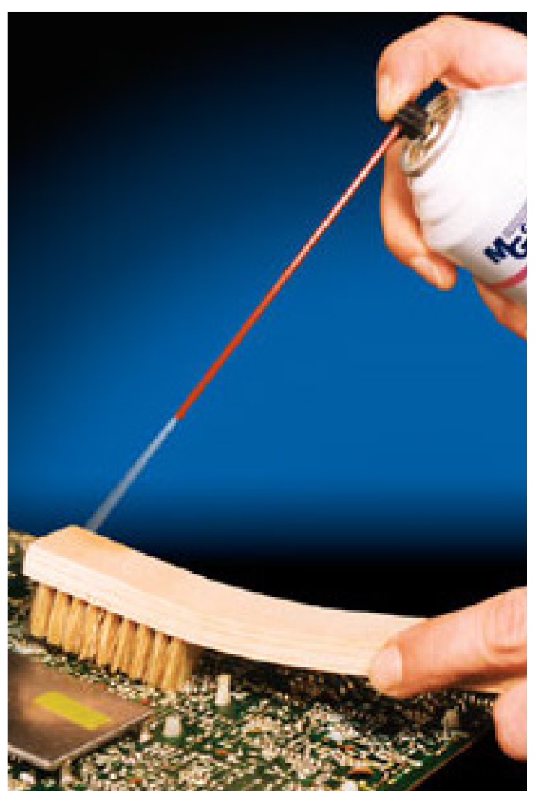
Dissolving the Flux

Removing flux is a two-step process that involves dissolving the flux and rinsing off the dissolved flux. The rinsing step is very important because after dissolving the flux it may appear that the solids in the flux have disappeared. But once the flux remover has evaporated away, the solids will re-deposit on the board as a white residue.