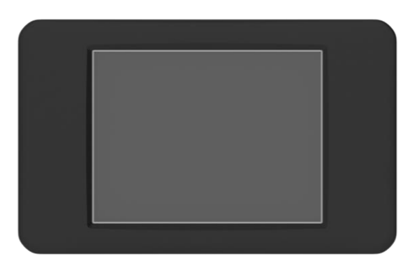
uLCD-32PTU Mounted in 3.2" Bezel - Front