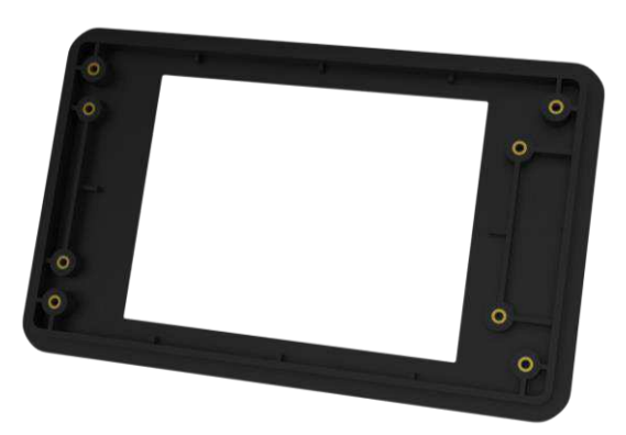
Bare 3.2" Bezel - Back