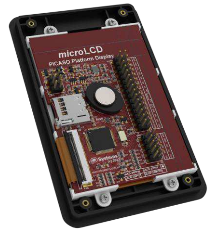
uLCD-32PTU Mounted in 3.2" Bezel - Back