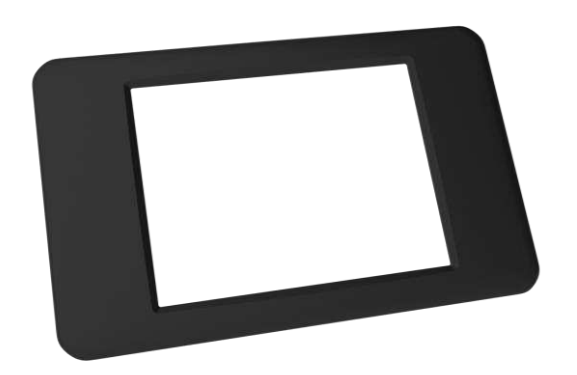
Bare 3.2" Bezel - Front