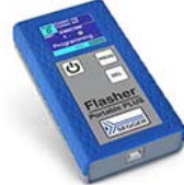
Flasher Portable PLUS

Flasher Portable PLUS is delivered with the following components: