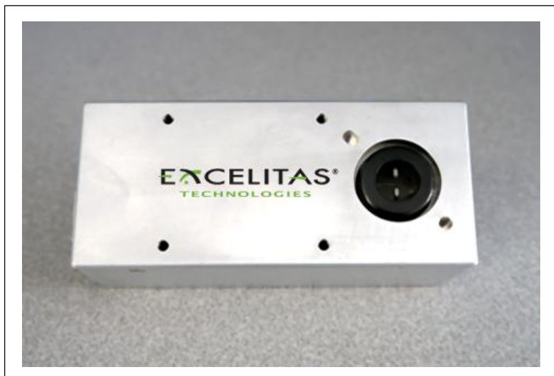
LS-6 Pulsed Xenon Light Source for UV/Vis/NIR Applications

The LS-6 from Excelitas Technologies is a 6 Watt Pulsed Xenon Light Source which has been designed to combine state-of-the-art circuitry and components into a packaged light source which provides microsecond-duration pulses of broadband light with exceptional arc stability. The compact, integrated solution contains the flash lamp, trigger circuit, and power supply in an EMI-suppressant enclosure.