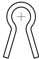
SHOWN AS SUPPLIED