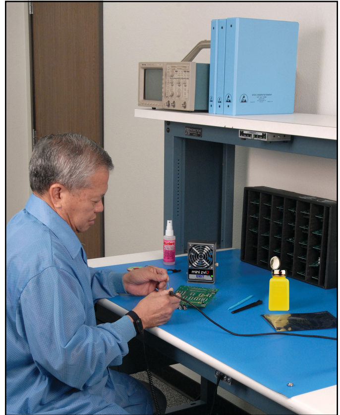
Figure 4. Using the Mini Zero Volt Ionizer 2 at a workstation.