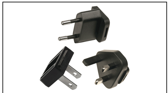
Figure 2. Interchangeable power adapter plugs included with the Mini Zero Volt Ionizer 2