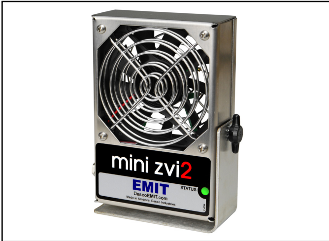
Figure 1. EMIT 50642 Mini Zero Volt Ionizer 2