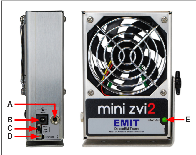
Figure 3. Mini Zero Volt Ionizer 2 features and components

A. Ground Jack: Insert the banana plug end of the included ground cord to this jack. Connect the ring terminal end of the cord to equipment ground.