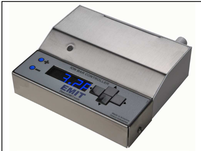
Figure 1. EMIT Pulsed Ion Bar Controller