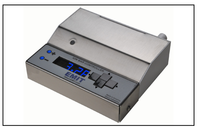
Figure 6. EMIT 50855 Controller with Digital Adjustment