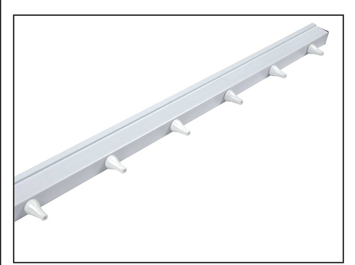
Figure 1. EMIT Non-Air Assisted Ion Bar