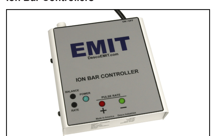
Figure 4. EMIT 50940 Controller with Recessed Potentiometer Adjustment