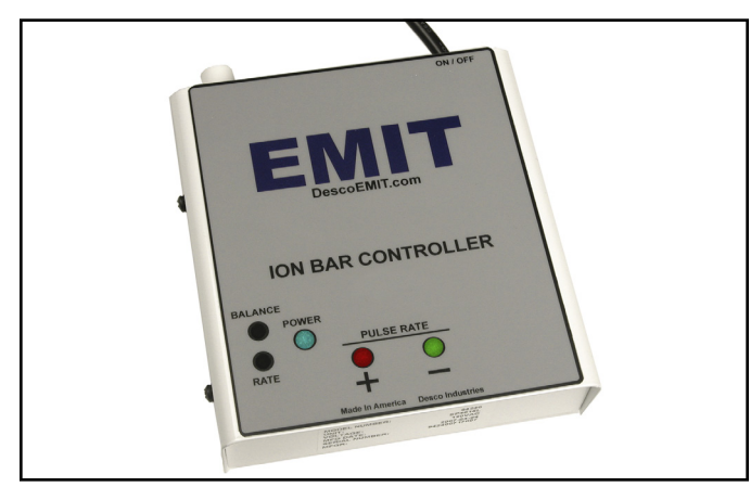
Figure 4. EMIT 50940 Controller with Recessed Potentiometer Adjustment