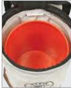
Holds 5 gallon bucket (not included)