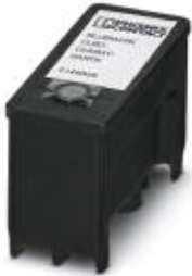
Dummy ink cartridge for the BLUEMARK CLED printer

Please be informed that the data shown in this PDF Document is generated from our Online Catalog. Please find the complete data in the user's documentation. Our General Terms of Use for Downloads are valid ( http://phoenixcontact.com/download )