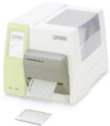
Cutter, for the THERMOMARK ROLL X1

Please be informed that the data shown in this PDF Document is generated from our Online Catalog. Please find the complete data in the user's documentation. Our General Terms of Use for Downloads are valid ( http://download.phoenixcontact.com )