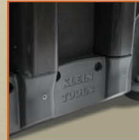
Molded kick plate to protect from the elements