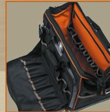
Maximum tool storage with shoulder strap and handles for easy carrying