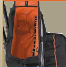
Wide open interior to accommodate large tools