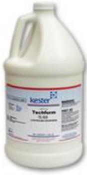
53-4004-0533 Techform Peelable Solder Mask 5 gal 1 units/case