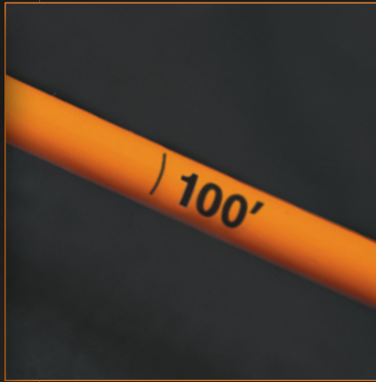
PERMANENT 1' MARKINGS