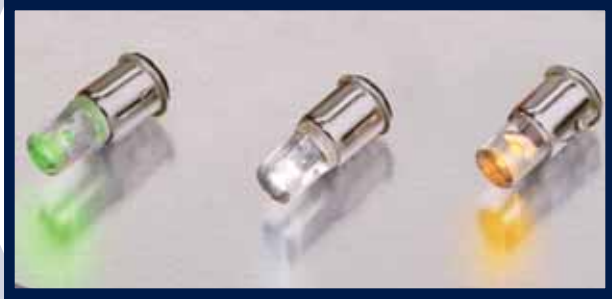
(Center Contact Negative)