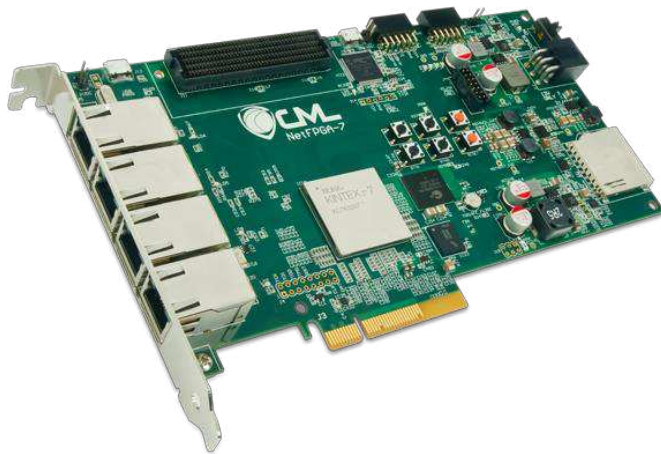
The NetFPGA-1G-CML board.

The NetFPGA-1G-CML is a versatile, low-cost network hardware development platform featuring a Xilinx® Kintex®-7 XC7K325T FPGA and includes four Ethernet interfaces capable of negotiating up to 1 GB/s connections. 512 MB of 800 MHz DDR3 can support high-throughput packet buffering while 4.5 MB of QDRII+ can maintain low-latency access to high demand data, like routing tables. Rapid boot configuration is supported by a 128 MB BPI Flash, which is also available for non-volatile storage applications. The standard PCIe form factor supports high speed x4 Gen 2 interfacing. The FMC carrier connector provides a convenient expansion interface for extending card functionality via Select I/O and GTX serial interfaces. The FMC connector can support SATA-II data rates for network storage applications. The FMC connector can also be used to extend functionality via a wide variety of other cards designed for communication, measurement, and control.