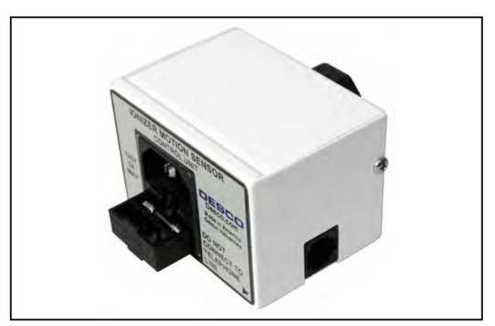
Figure 6. Replacing the fuse in the Control Unit

The fuse located in the Control Unit may be replaced by removing the power cord and opening the fuse drawer at the IEC inlet. The Control Unit uses one 5A, 250V slow blow fuse. DO NOT use other ratings as it may pose a safety hazard.