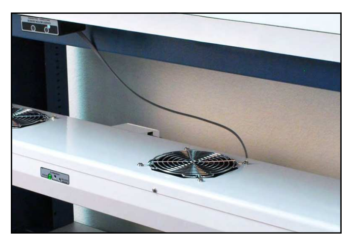
Figure 5. Using the Ionizer Motion Sensor with the <u>60473</u> Chargebuster<sup>®</sup> 3-Fan Overhead Ionizer

DESCO WEST - 3651 Walnut Avenue, Chino, CA 91710 • (909) 627-8178 DESCO EAST - One Colgate Way, Canton, MA 02021-1407 • (781) 821-8370 • Website: Desco.com