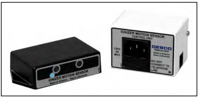
Figure 1. Desco 60509 Ionizer Motion Sensor