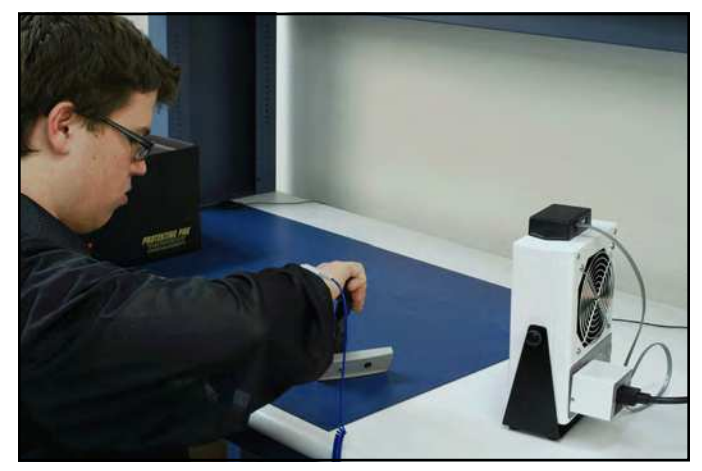
Figure 4. Using the Ionizer Motion Sensor with the <u>60505</u> High Output Bench Top Ionizer

Leave the sensor's field of view to activate the shutoff delay timer. The Ionizer Motion Sensor's LED will turn off and unpower the ionizer once the preset deactivation delay time is reached.