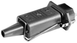
Cord retaining kits Cord retaining strain relief