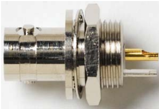
Model 6741 BNC (F) Bulkhead, Isolated ground