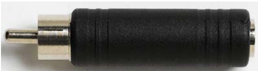
Model 6879 1/4" Jack (mono) / RCA Plug Adapter