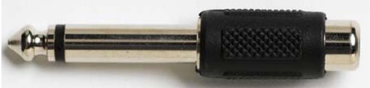
Model 6878 1/4" Plug (mono) / RCA Jack Adapter