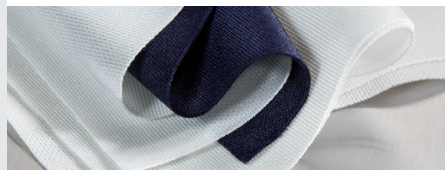
Cleanroom-ready woven polyester wipes

Clean grime and solder flux with confidence