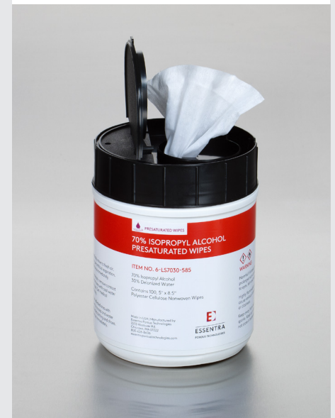
Economy-sized alcohol wipes

Quickly remove grease, inks and adhesives from equipment