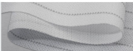
Negastat-enhanced carbon fiber wipes

Wipe away contaminants without static discharge