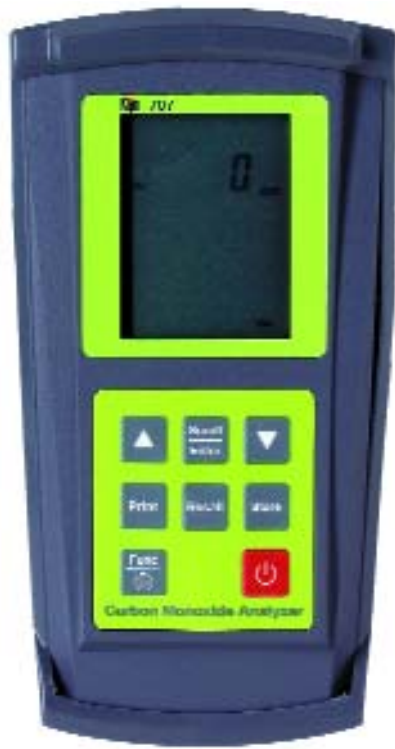
4.0"w X 8.12"h x 2.25"d

Test flue gasses at home or office spaces for the presence and location of CO leaks. With a protective rubber boot, the new 707 fits comfortably in your hand and operates with the push of a button.