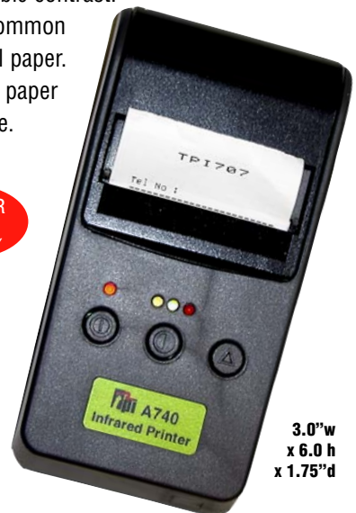
3.0"w x 6.0 h x 1.75"d