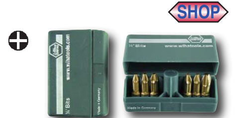
711 96 PokitPak - Phillips TiN Coated Insert Bits In Molded Case -