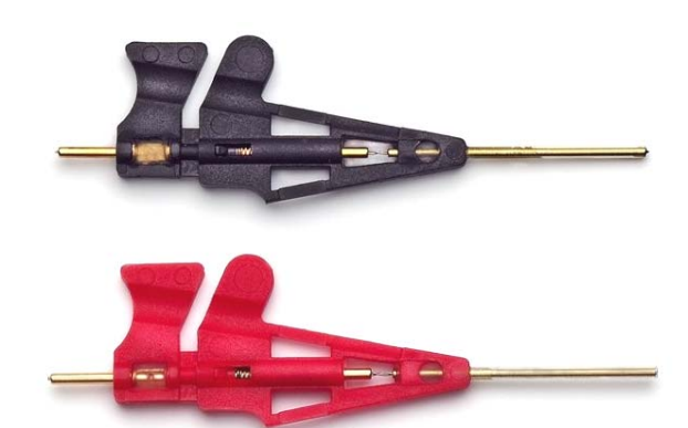
Model 72902-0 & 72902-2 Micro SMD Grabber Test Clips

Model: 72903 (Holding Rods on page 1, sold 10 per package)