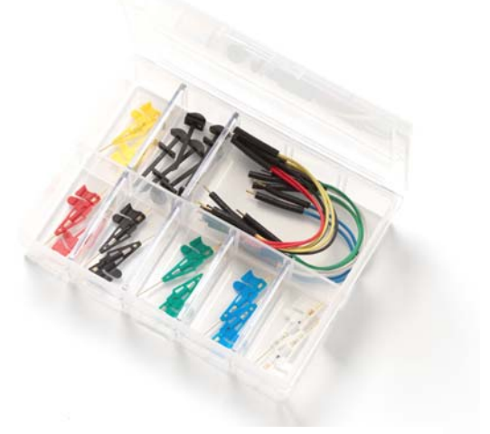
Model 72902 Micro SMD Grabber Test Clips Kit