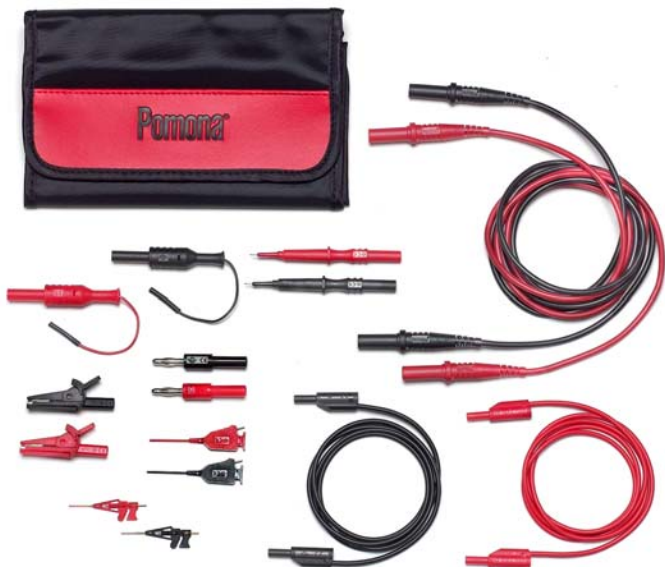
Model 72928 SMD Multi-Use Test Kit

Everything you need for SMD Test with your DMM in one kit