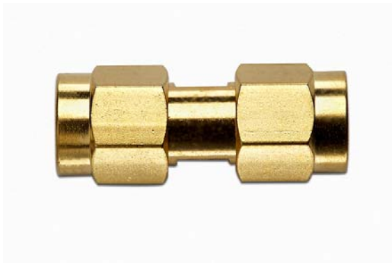
Model 72964 SMA PLUG (M) / PLUG (M)

High bandwidth, small size, and durability for confident connections.