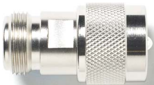
Model 73047 N Type Jack to UHF Plug Adapter