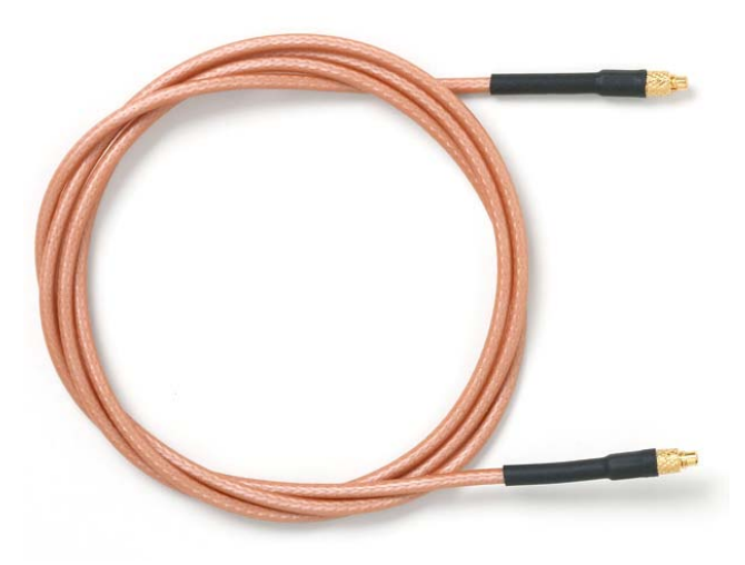
Model 73063 MMCX Plug to MMCX Plug, RG316/U