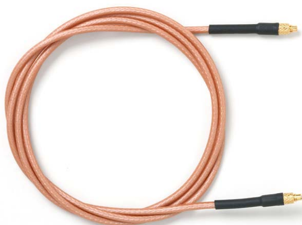
Model 73063 MMCX Plug to MMCX Plug, RG316/U

Snap-on coupling and micro-miniature size for fast connect and disconnect where space is limited