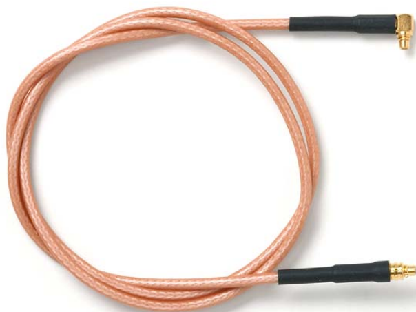
Model 73064 MMCX Plug to Right-Angle MMCX Plug, RG316/U

Snap-on coupling and micro-miniature size for fast connect and disconnect where space is limited