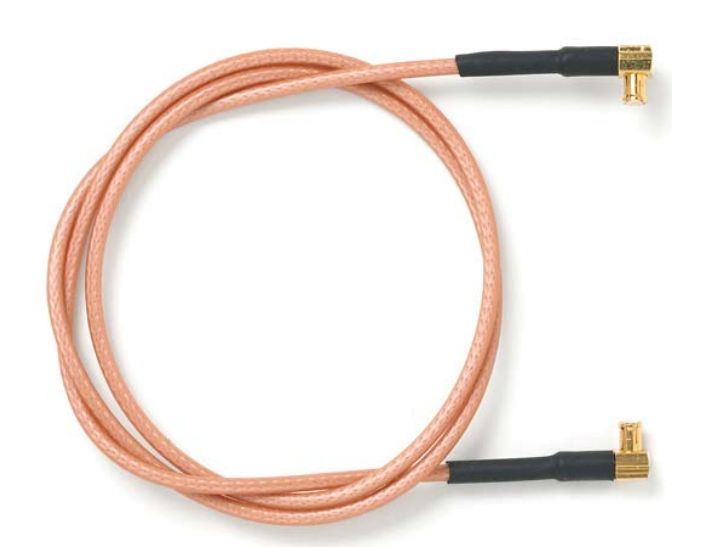
Model 73068 MCX Right-Angle Plug to MCX Right-Angle Plug, RG316/U