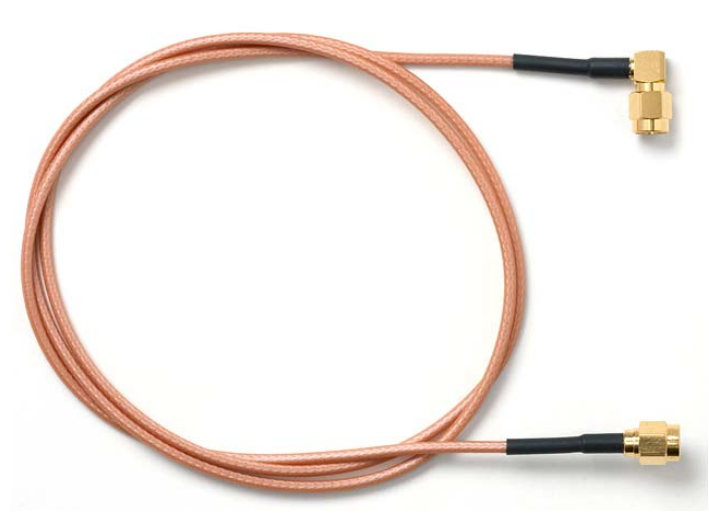
Model 73069 SMA Plug to SMA Right-Angle Plug, RG316/U