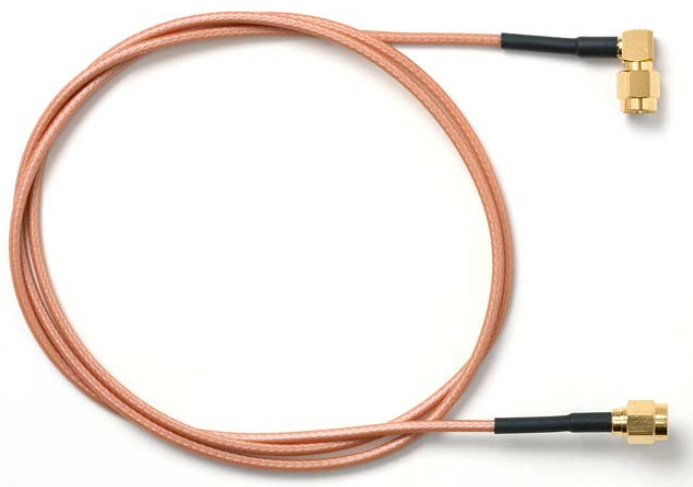
Model 73069 SMA Plug to SMA Right-Angle Plug, RG316/U