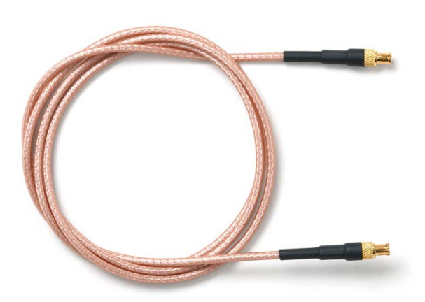
Model 73075-VV MCX Plug to MCX Plug, RG179B/U, 75 Ohm