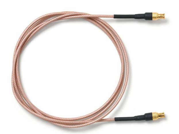
Model 73075-UU MCX Plug to MCX Plug, RG178B/U, 50 Ohm

MCX Plug to MCX Plug, RG178B/ U (50 Ohm), RG179B/ U (75 Ohm)