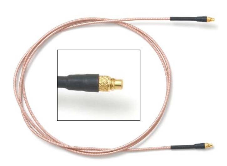
Model 73077 MMCX Plug to MMCX Plug, RG178B/U

Snap-on coupling and microminiature size for fast connect and disconnect where space is limited