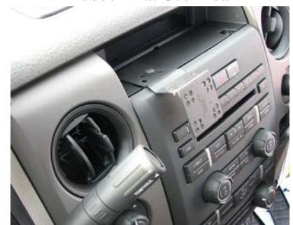
Mount in Place with Mounting Plate in Left Side Down Position