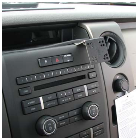
Mount in Place with Mounting Plate in Right Side Down Position