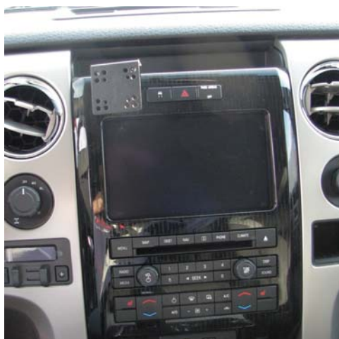
Mount in Place with Mounting Plate in Left Side Down Position on Nav.