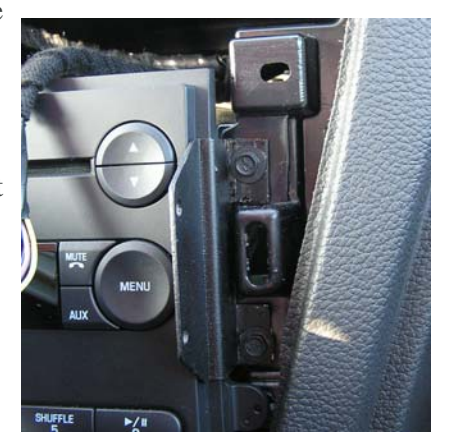
Bottom Part in Place, Right Side

Read instructions completely prior to starting installation. All InDash Mounts are designed so that after installation, phone is facing normal driver position for left-hand drive vehicles. This mount is not designed to be used in foreign countries with right-hand drive vehicles. Use extreme care when working around the plastic components on the dash. Excess force, can cause breakage of the plastic components.