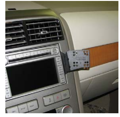
MKX Final Installation Picture