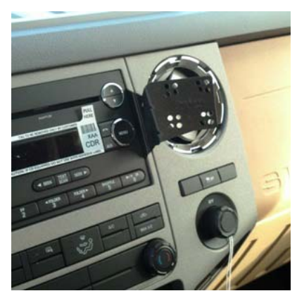
Final Installation Picture of Super Duty 2013 Without NAV

Read instructions completely prior to starting installation. All InDash Mounts are designed so that after installation, phone is facing normal driver position for left-hand drive vehicles. This mount is not designed to be used in foreign countries with right-hand drive vehicles. Use extreme care when working around the plastic components on the dash. Excess force, can cause breakage of the plastic components.