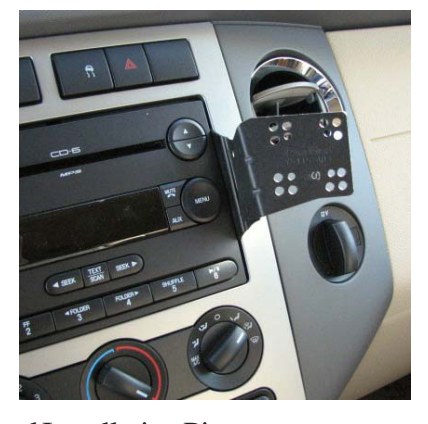
Expedition and F-150 Final Installation Picture