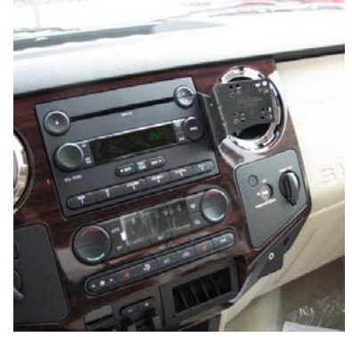
Final Installation Picture on 08-10

INSTALLATION IS NOW COMPLETE. ENJOY YOUR NEW INDASH by PANAVISE MOUNT.