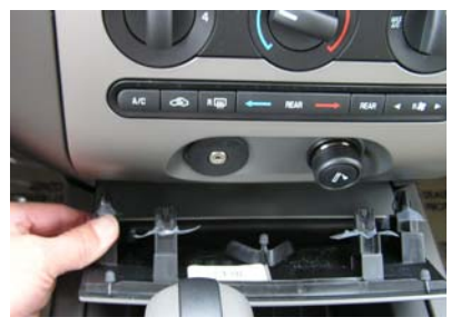
Expedition Cover Removal

Read instructions completely prior to starting installation. All InDash Mounts are designed so that after installation, phone is facing normal driver position for left-hand drive vehicles. This mount is not designed to be used in foreign countries with right-hand drive vehicles. Use extreme care when working around the plastic components on the dash. Excess force, can cause breakage of the plastic components.