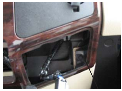
Right & Left Covers and Screws

Read instructions completely prior to starting installation. All InDash Mounts are designed so that after installation, phone is facing normal driver position for left-hand drive vehicles. This mount is not designed to be used in foreign countries with right-hand drive vehicles. Use extreme care when working around the plastic components on the dash. Excess force, can cause breakage of the plastic components.