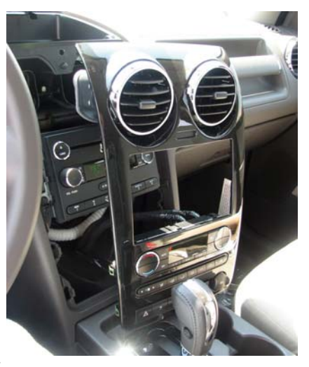
Dash Bezel Removed

Read instructions completely prior to starting installation. All InDash Mounts are designed so that after installation, phone is facing normal driver position for left-hand drive vehicles. This mount is not designed to be used in foreign countries with right-hand drive vehicles. Use extreme care when working around the plastic components on the dash. Excess force, can cause breakage of the plastic components.