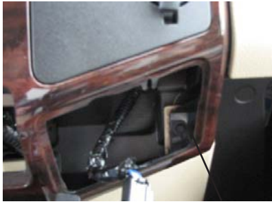
Right & Left Covers and Screws

Read instructions completely prior to starting installation. All InDash Mounts are designed so that after installation, phone is facing normal driver position for left-hand drive vehicles. This mount is not designed to be used in foreign countries with right-hand drive vehicles. Use extreme care when working around the plastic components on the dash. Excess force, can cause breakage of the plastic components.