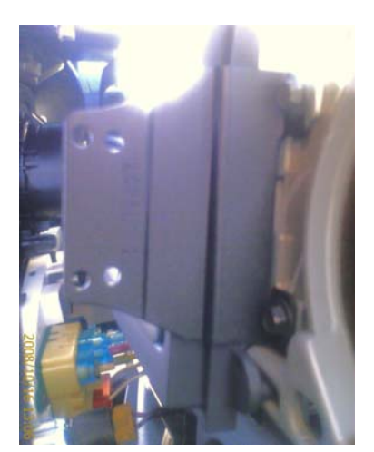
Bottom Piece Installed

STEP#3: Replace bezel. Install the TOP part (75001) on to the BOTTOM with the (2) Acorn nuts and a 5/16" wrench. Replace the bezel.