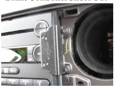
Bottom part in place