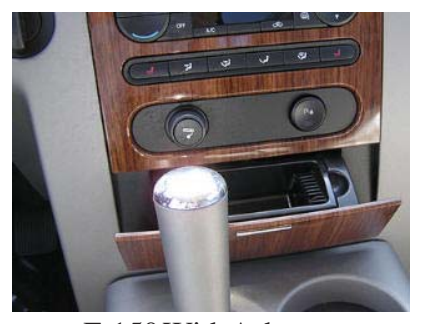
F-150 With Ashtray