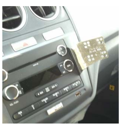
Final Installation Picture of Transit Connect 2013

INSTALLATION IS NOW COMPLETE. ENJOY YOUR NEW INDASH by PANAVISE MOUNT.