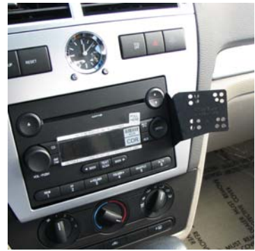
Final Installation Picture on 500 and Montego

INSTALLATION IS NOW COMPLETE. ENJOY YOUR NEW INDASH by PANAVISE MOUNT.