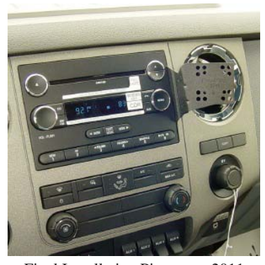
Final Installation Picture on 2011