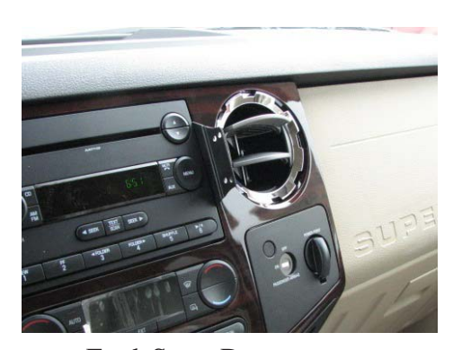
Final Installation Pictures on Ford-Super Duty