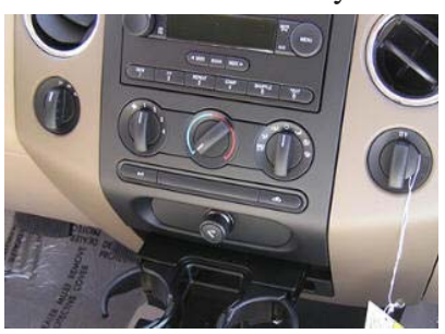
F-150 Without Console