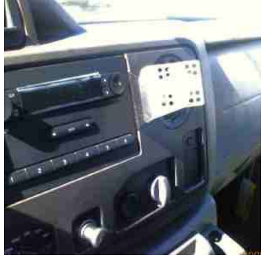
Finished Install Picture

INSTALLATION IS NOW COMPLETE. ENJOY YOUR NEW INDASH by PANAVISE MOUNT.