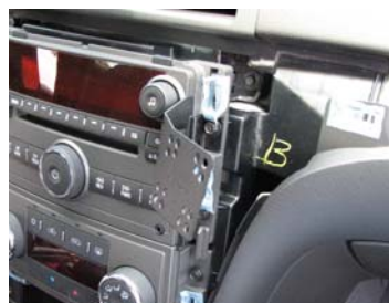
Mount in Place