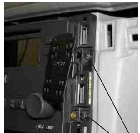
Upper Mounting Location Screw Lower Mounting Location Screw