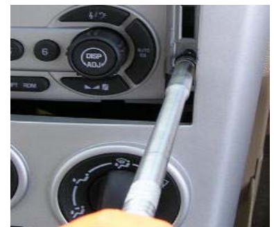
Lower Installation Location screw removal