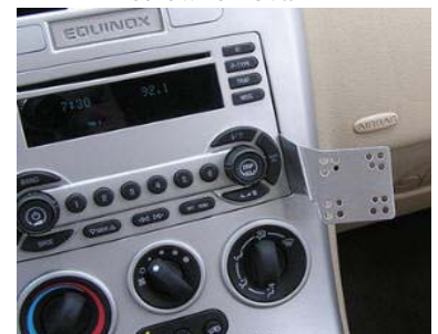
Lower Installation Location

InDash installed showing upper location on new style radio.