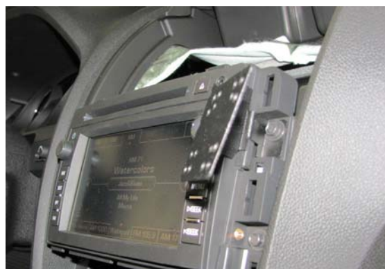
Mount in Place Showing Location