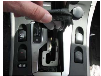
T-15 Torx Screw, T-10 Torx Screw

INSTALLATION IS NOW COMPLETE. ENJOY YOUR NEW INDASH by PANAVISE MOUNT.