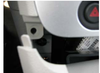
Flat Pins of Shifter Bezel

INSTALLATION IS NOW COMPLETE. ENJOY YOUR NEW INDASH by PANAVISE MOUNT