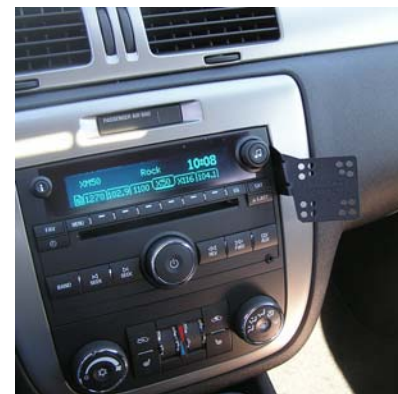
Impala, Monte Carlo Install Picture

Read instructions completely prior to starting installation. All InDash Mounts are designed so that after installation, phone is facing normal driver position for left-hand drive vehicles. This mount is not designed to be used in foreign countries with right-hand drive vehicles. Use extreme care when working around the plastic components on the dash. Excess force, can cause breakage of the plastic components.