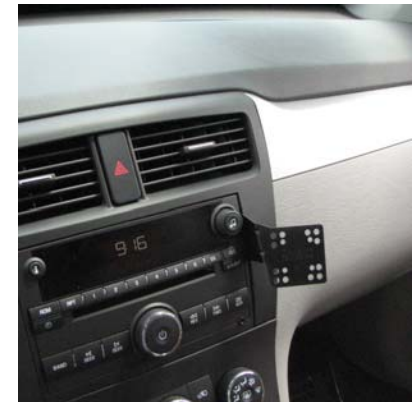
Suzuki XL-7 Final Install Picture