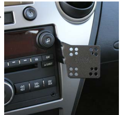
Saturn Ion Final Installation Picture