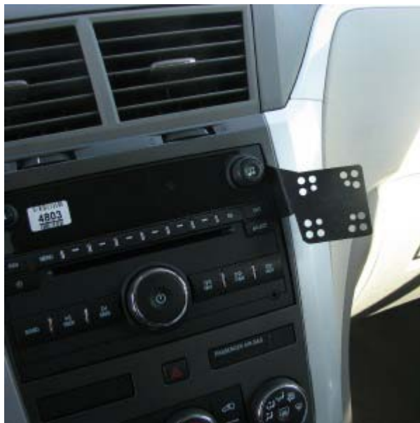
Installation of InDash Mount

INSTALLATION IS NOW COMPLETE ENJOY YOUR NEW INDASH by PANAVISE MOUNT