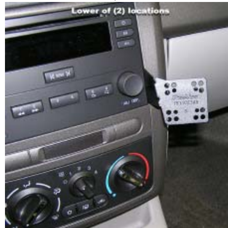
InDash Lower Mounting Location