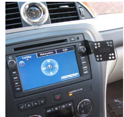
Buick Enclave Final Install Picture