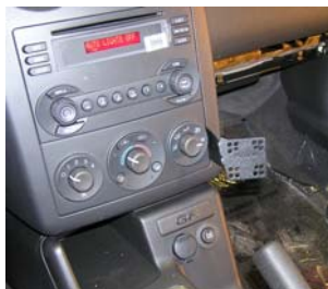
Final Installation Picture - G6