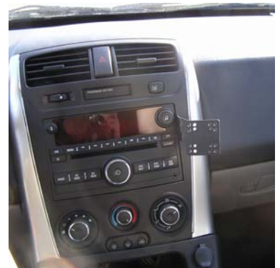
Saturn Vue 2006 Final Installation Picture

STEP #4: Replace the bezel carefully starting from the right side by the Installed Mount. INSTALLATION IS NOW COMPLETE. ENJOY YOUR NEW INDASH by PANAVISE MOUNT.