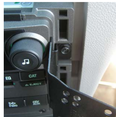
Mounting Location Picture - All