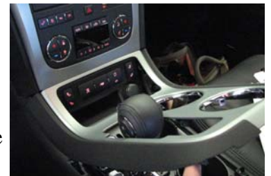
Shifter Console Removal

INSTALLATION IS NOW COMPLETE. ENJOY YOUR NEW INDASH by PANAVISE MOUNT.