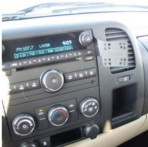
Installation of InDash Mount on Work Truck dash