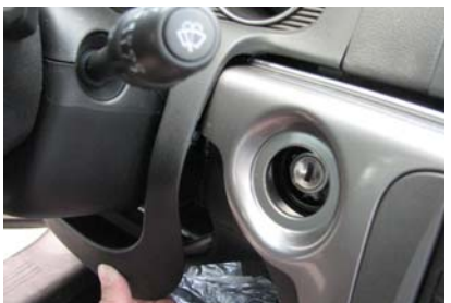
Ignition Switch Removed