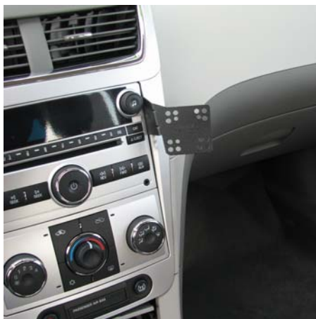
Final Installation Picture