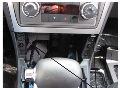
Climate Control Screws