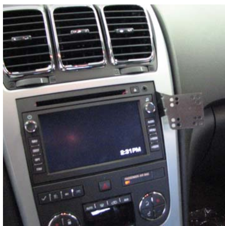
Final Installation Picture