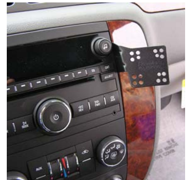
Chevy Tahoe, Suburban 2007

INSTALLATION IS NOW COMPLETE. ENJOY YOUR NEW INDASH by PANAVISE MOUNT.