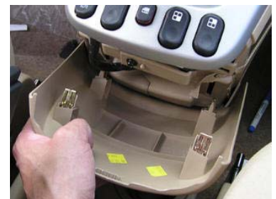
Removal of back cover

INSTALLATION IS NOW COMPLETE. ENJOY YOUR NEW INDASH by PANAVISE MOUNT.