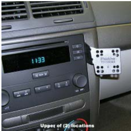
InDash Upper Mounting Location

INSTALLATION IS NOW COMPLETE. ENJOY YOUR NEW INDASH by PANAVISE MOUNT.