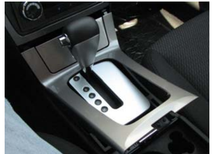
Shifter Bezel Removal