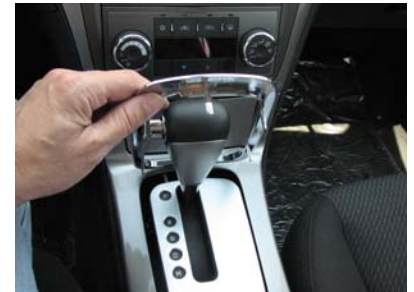
Shifter Bezel Ring Removal

Read instructions completely prior to starting installation. All InDash Mounts are designed so that after installation, phone is facing normal driver position for left-hand drive vehicles. This mount is not designed to be used in foreign countries with right-hand drive vehicles. Use extreme care when working around the plastic components on the dash. Excess force, can cause breakage of the plastic components.