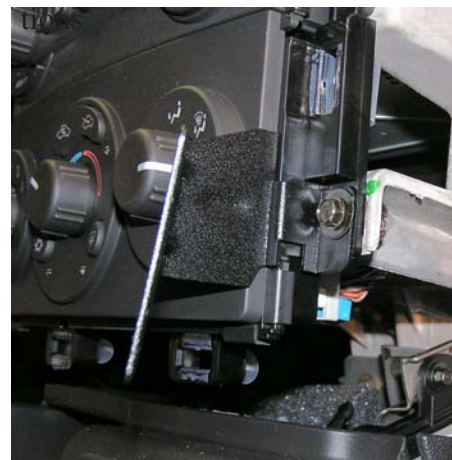
Mount installed showing location