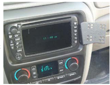
InDash by PanaVise Installed on TrailBlazer 2004 with Fact.Navi.