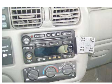
Finished Install Picture, Chevy S-10, 2003-04