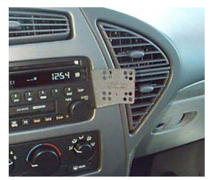
Finished install picture Rendezvous