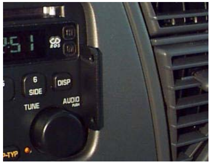
Part A installed on Rendezvous