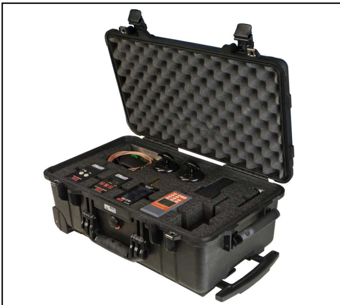
Figure 2. SCS 752 EOS/ESD Audit Kit, Premium