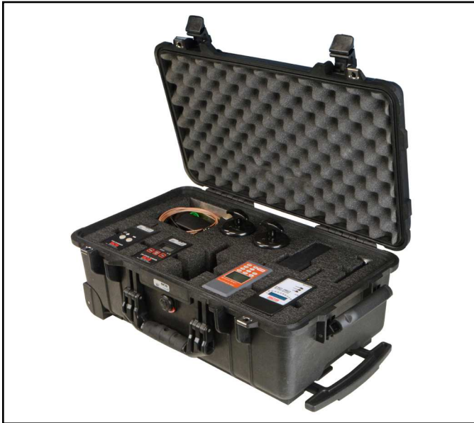
Figure 1. SCS 751 EOS/ESD Audit Kit, Standard