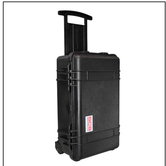
Figure 3. Extendable handle on the carrying case