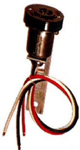
Photo Cell Socket

3000 installs in existing ANSI compliant pole top sockets. The CRD 3000 installs without software tools, using simple, on/off indicator lights to tell installers that reliable RF communications have been established within seconds of installation. As an integral infrastructure device, no changes are required to existing maintenance, management, and visualization software for LonWorks based street lighting networks utilizing the SLB.