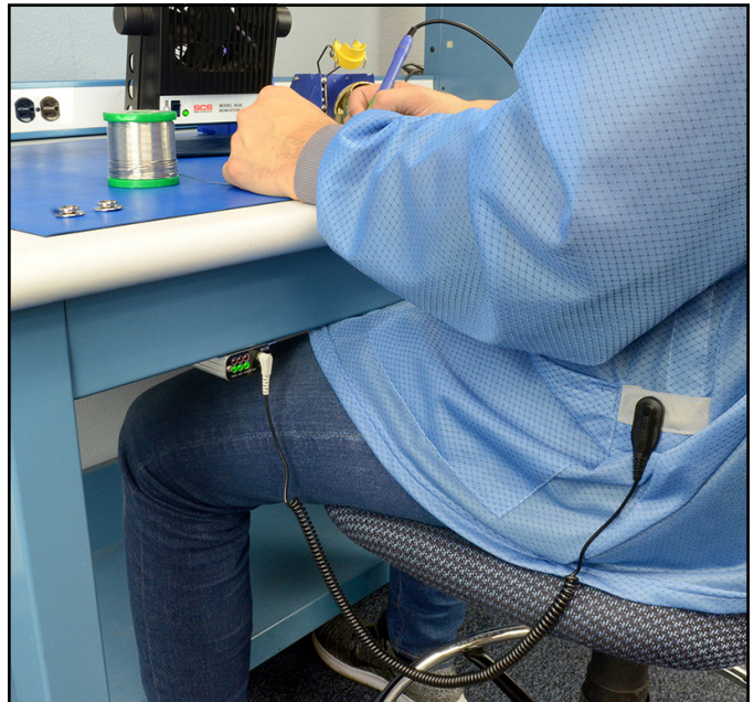
Figure 6. Using the Dual-Wire Static Control Smock with the SCS CTC331-WW Iron Man® Plus Workstation Monitor