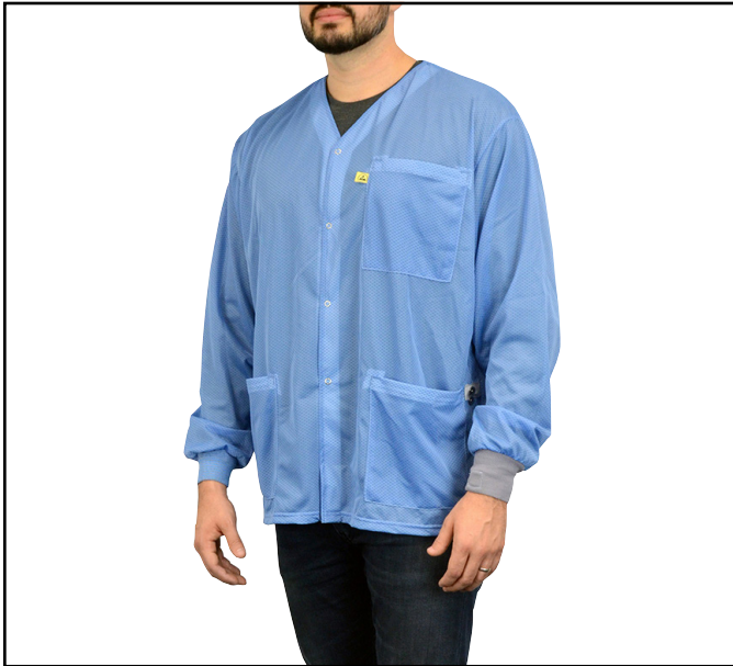
Figure 1. SCS Dual-Wire Static Control Smock