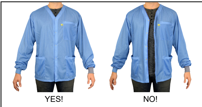
Figure 3. Proper wear of the Dual-Wire Static Control Smock