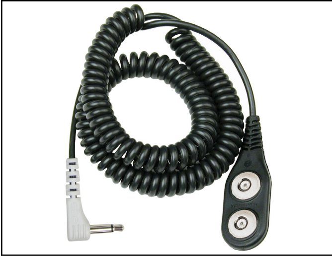
Figure 2. SCS 770110 MagSnap® Dual-Wire Coil Cord