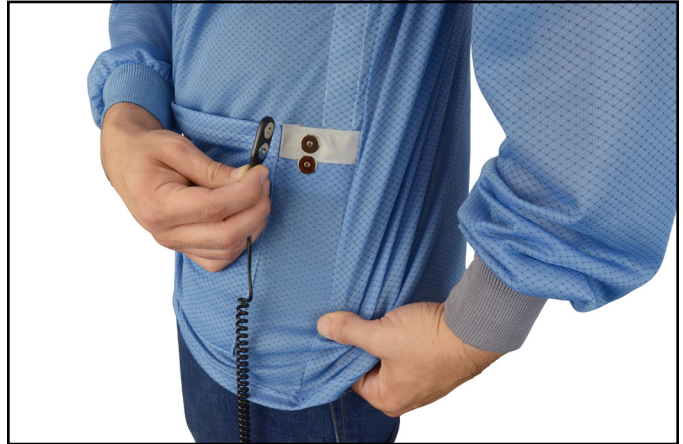
Figure 5. Connecting the SCS MagSnap® Dual-Wire Coil Cord to the Dual-Wire Static Control Smock